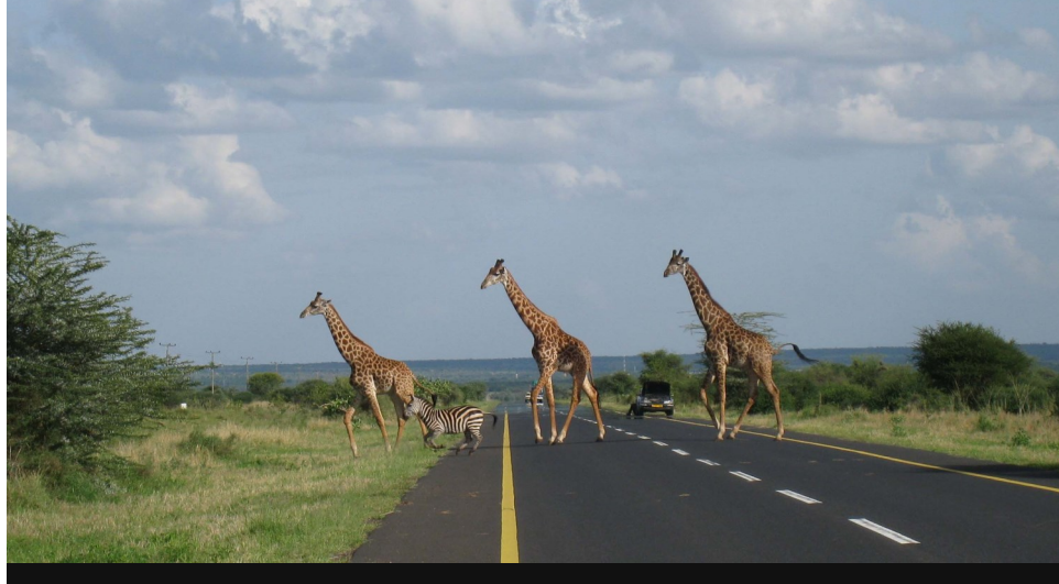
APPLICATION DEADLINE: DECEMBER 15, 2015